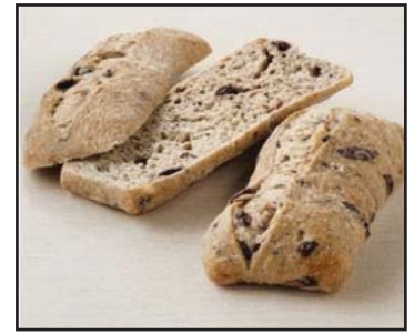
Ciabatta Sandwich Olives

Item # 58516 pack size: 48 / 4.25 oz Lenght: 5.9"