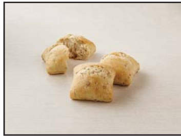
Ciabatta Roll Multigrain

Item # 58503 pack size: 60 / 1.6 oz Length: 3.54"