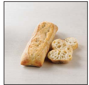
Ciabatta Demi Baguette

Item # 58527 pack size: 18 / 11.5 oz Lenght: 18.9"