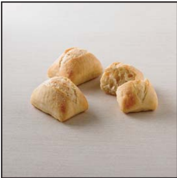
Ciabatta Roll Plain

Item # 58503 pack size: 60 / 1.6 oz Length: 3.54"