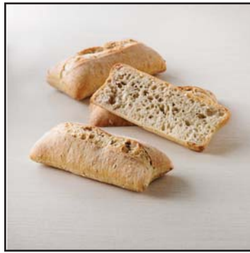
Ciabatta Sandwich Multigrain

Item # 58510 pack size: 48 / 4.25 oz Lenght: 5.9"