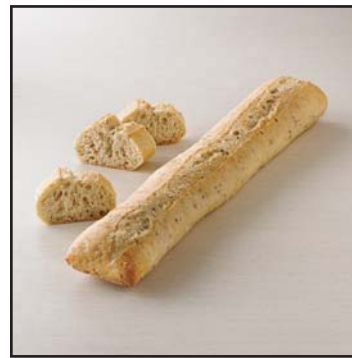
Ciabatta Baguette Multigrain

Item # 58529 pack size: 18 / 11.5 oz Lenght: 18.9"