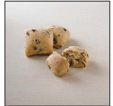
Ciabatta Roll Olives

Item # 58505 pack size: 60 / 1.6 oz Length: 3.1"