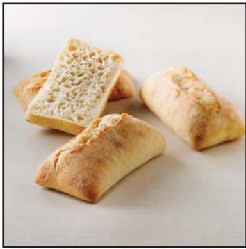
Ciabatta Sandwich Plain

Item # 58510 pack size: 48 / 4.25 oz Lenght: 5.9"